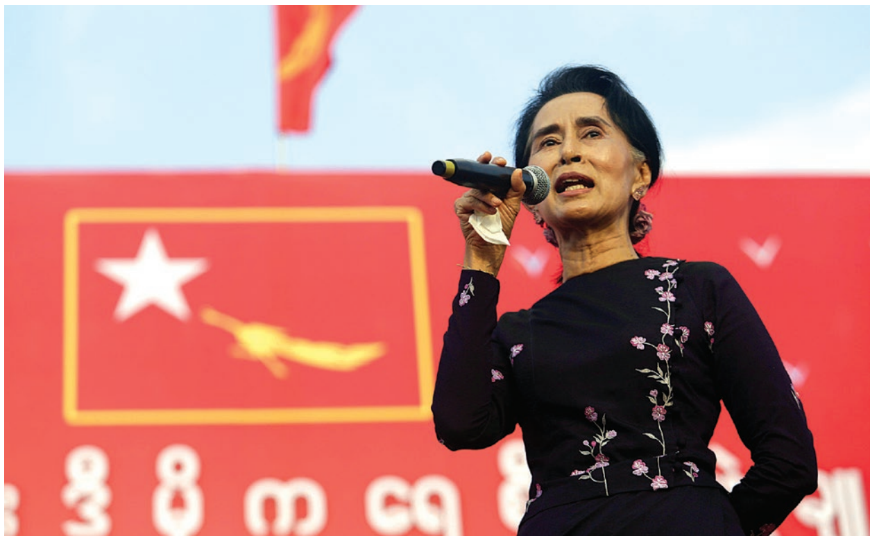
Aung San Suu Kyi delivers a campaigning speech at a rally in Yangon, Myanmar, November 2015

During military rule in the 1990s and early 2000s, media development organizations and donors focused their efforts on supporting media organizations in exile, as there were few independent outlets operating inside the country and it was risky to offer them support. Ethnic minority media and languages were outlawed