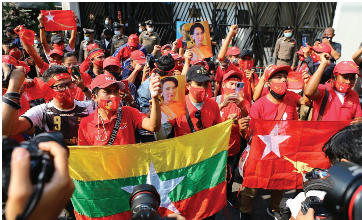
NLD supporters protest outside Myanmar Embassy against the military coup, February, 2021, Bangkok, Thailand.

The coalition undertook a multifaceted strategy to educate grassroots community organizations about the importance of RTI in their lives, while simultaneously trying to get buy-in from government officials by framing RTI as a tool for efficiency and government transparency. The coalition cultivated a select cadre of “champions” to advocate for the passage of an RTI bill in parliament. Ultimately, the draft law was submitted to parliament, but a key provision was deleted and the proposal has since languished with the Ministry of Information. The coup effectively ended efforts to revive it.