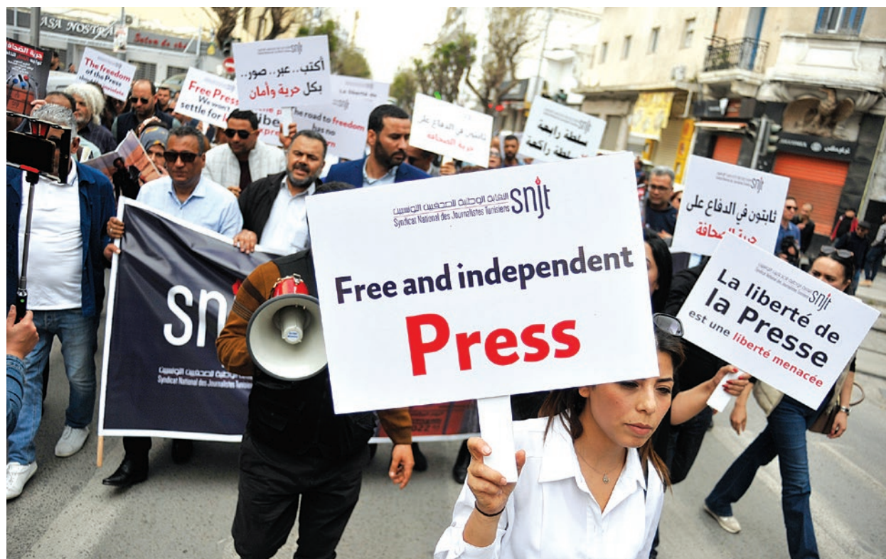
Tunisian Journalists protest against the repression of journalist after they were subjected to attacks in a coverage by opponents of the Tunisian President, May 2022.

The funding forces us to take sides and to invite some figures to talk shows and ignore others. If we want to be independent from all camps, we will find ourselves outside the game and we will not enjoy any financial support. 64