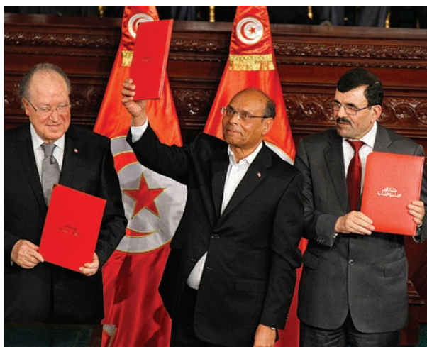
President of the Tunisian National Constituent Assembly (NCA) Mustapha Ben Jaafar (L), President Moncef Marzouki (C) and outgoing Islamist Prime Minister Ali Larayedh (R) pose after signing the country's new constitution in Tunis, January 27, 2014.

with the outcomes of the uprising, particularly the growing social and economic inequality driving the youth to immigration or despair.